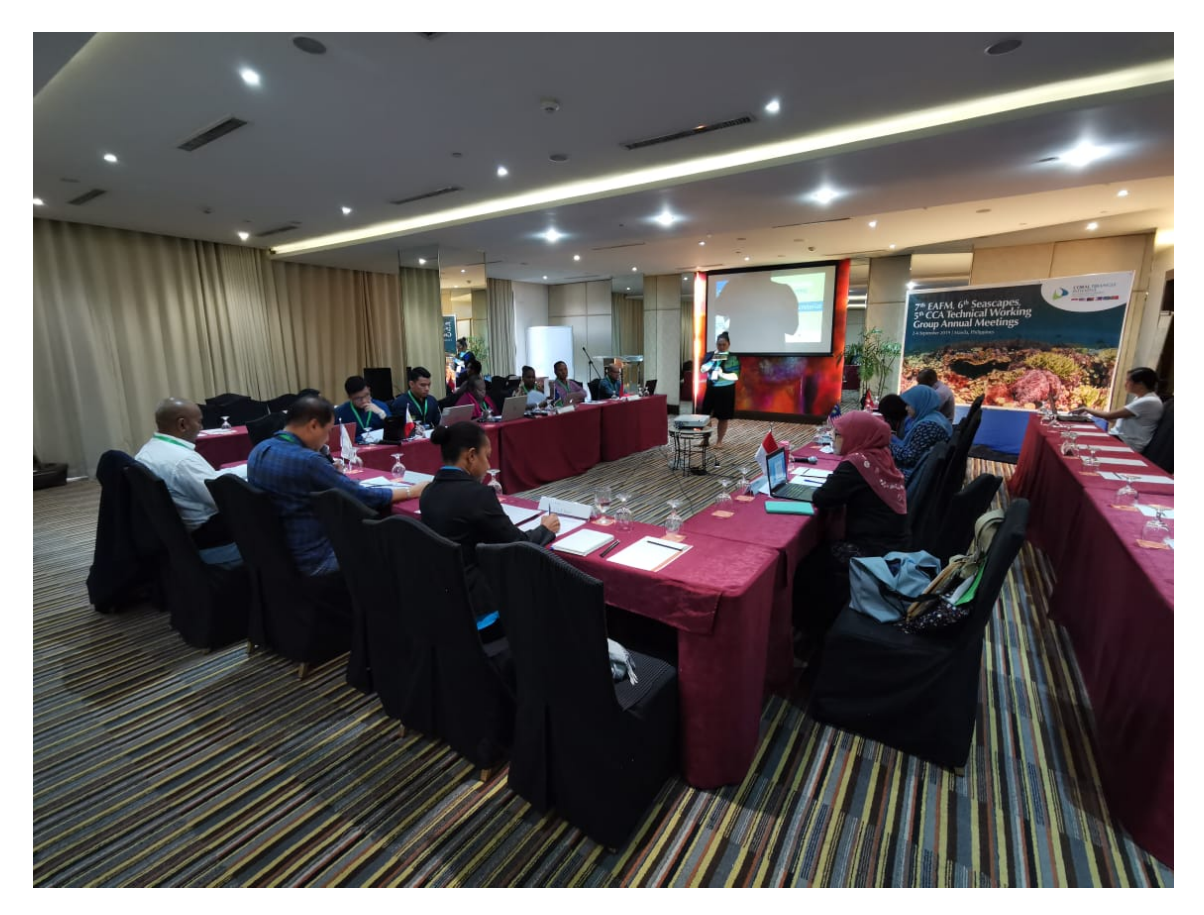
Figure 4. Group discussions