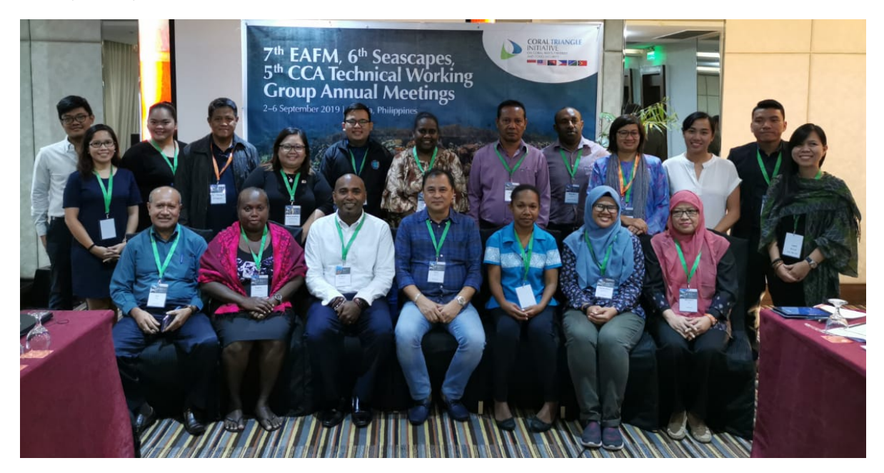
Figure 2. Group photo

After the opening messages, the Chair initiated a round of introductions. The meeting was attended by representatives from the CT6 countries – Indonesia, Malaysia, Papua New Guinea, Philippines, Solomon Islands and Timor-Leste, and RS (Annex A). There were no representatives from the development partners.